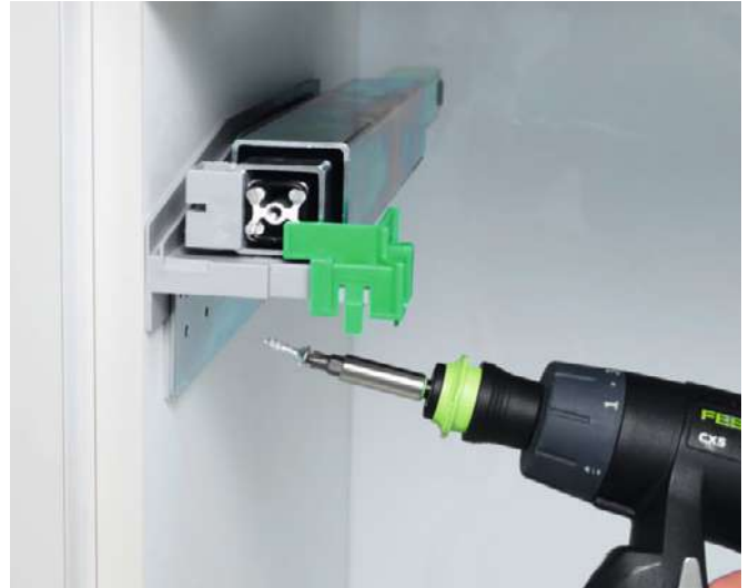
... for easy fixing.