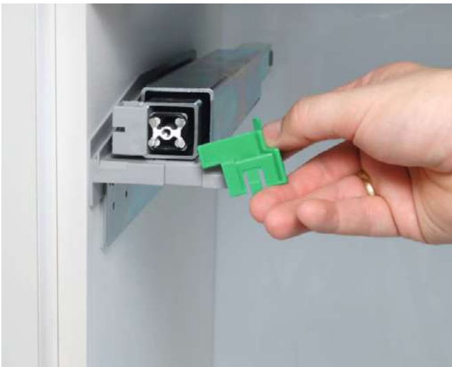
Remove transportation lock.