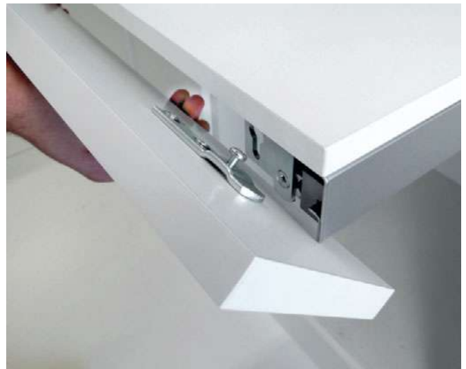
Click front into place and fix it.